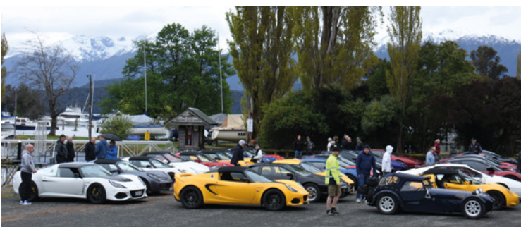
The sun didn't shine for the whole trip, but it didn't dampen drivers' spirits