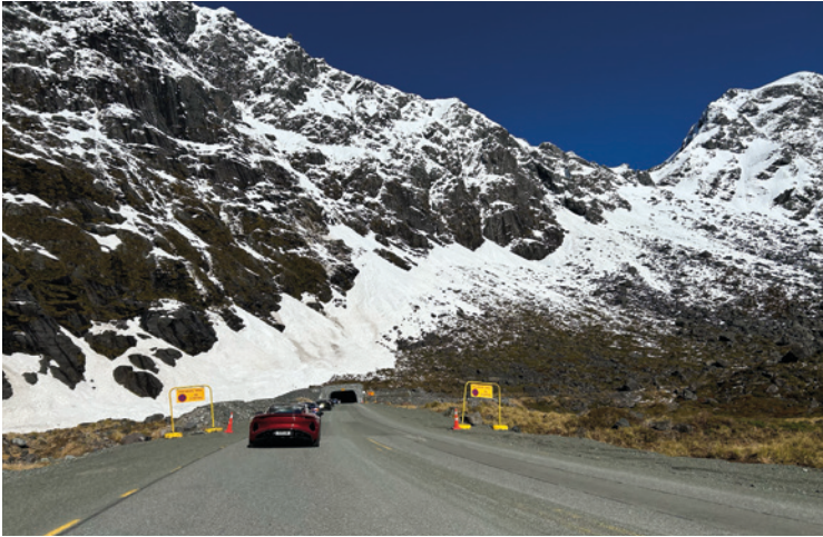
There's no shortage of spectacular scenery and photogenic backdrops in New Zealand