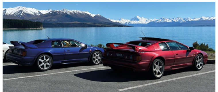
A brace of Esprits at a lakeside vista on the fourth and final day of the trip