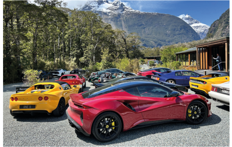
The Lotuses regrouping at Milford Sound. They vie with mother nature for attention

said, the entire route back from Te Anau to Queenstown, then over the Crown Range to Cardrona and all the way through the Lindis Pass and Mackenzie Country to Lake Pukaki and Tekapo is not exactly dull. In terms of driving roads, many of these stretches offer more enjoyable fast flowing corners and, if you're lucky, traffic-free passage where a Lotus can be thoroughly exercised. And the scenery is still not too shabby!